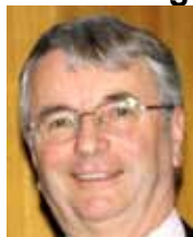
Secretary UTS Northern Suburbs Athletic Club Inc.