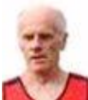
Treasurer UTS Northern Suburbs Athletic Club Inc.