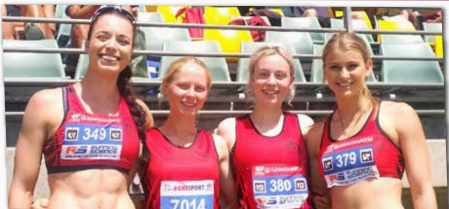
Well done ladies Smiles all round