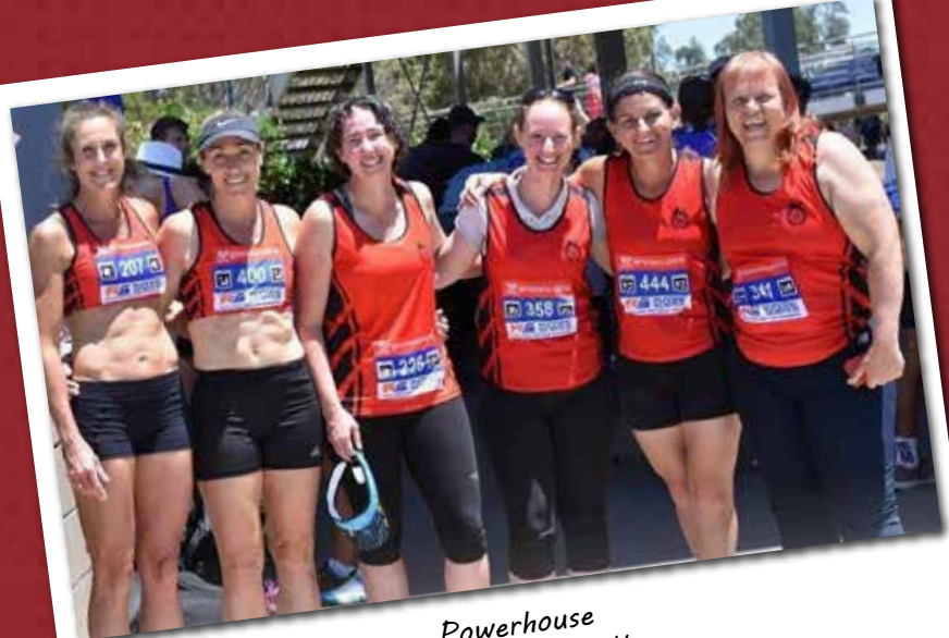
Powerhouse Women's team!!