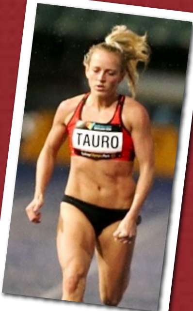
Tauro! Nothing more to say