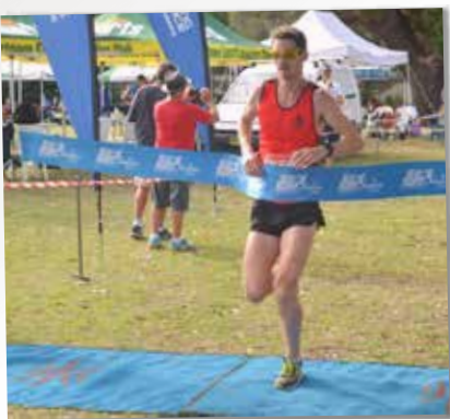
Coxsy breaking the tape again