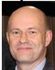
President UTS Northern Suburbs Athletic Club Inc.