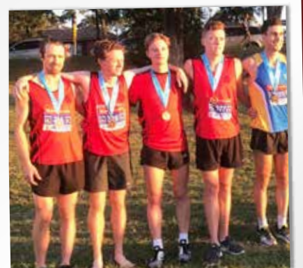
Mens XC success - Gold in 2016 and Bronze at the 2017 Relays