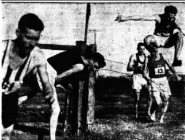
FANCY 10,000 OF THIS! Athletes doing a little fencing in the N.S.W. cross-country 10,000 metres championship. One man seems to be taking part in the high jump, but really it's only his way of getting over the obstacles.